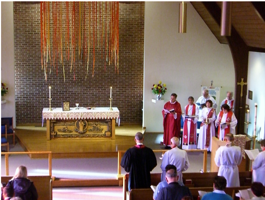
Episcopalians and Methodists stand together at joint service on June 14th