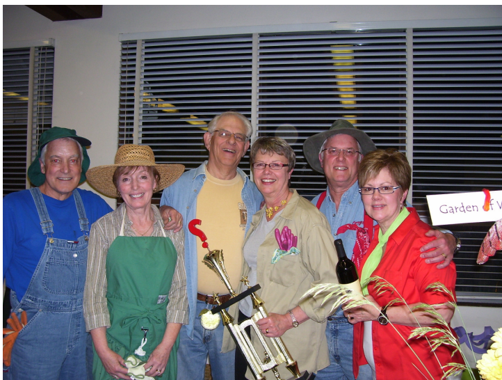
The Quiz Night winning team, "The Garden of Weeden"